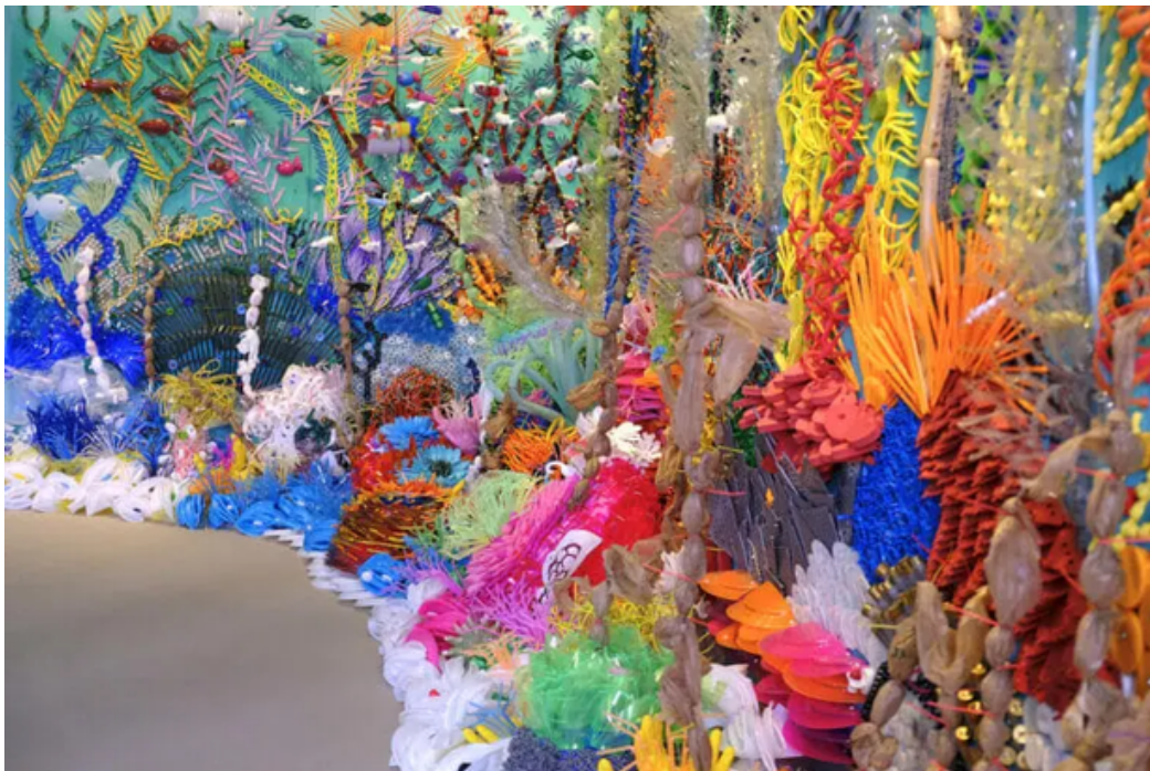
Installation view of Federico Uribe, Plastic Reef , 2018–23. Recycled plastic.

Federico Uribe is a Colombian artist who now lives in Florida. His playful sculptures and installations are made from repurposed materials. Plastic Reef (pictured above) is a room that is decorated entirely out of recycled plastics. Why do you think Uribe choose to use recycled plastics to make a coral reef scene?