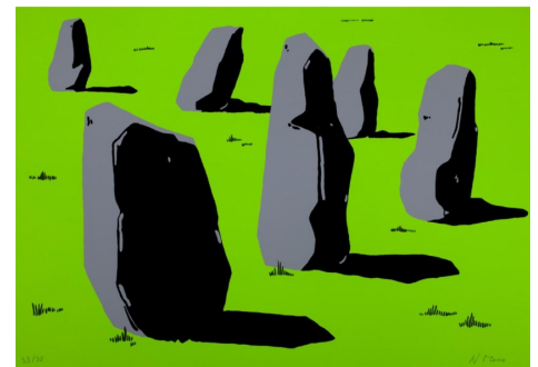
Inspiration Image: Nicholas Monro, Stone Circle , 1972 Screenprint, 24.5 in. x 34.5 in. Collection of the Madison Museum of Contemporary Art. Gift of Sam Solotkin.