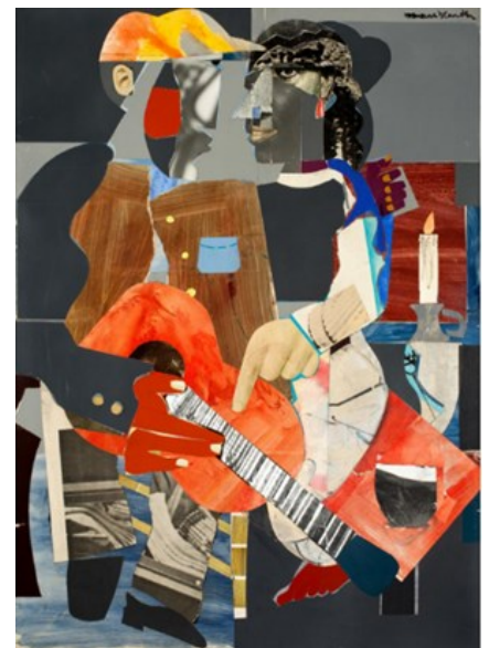
Inspiration Image: Romare Bearden, Serenade , 1969. Collage and paint on panel. 45.75 in. x 32.5 in. Collection of the Madison Museum of Contemporary Art. Purchase, through a National Endowment for the Arts Grant with matching funds contributed by museum members.