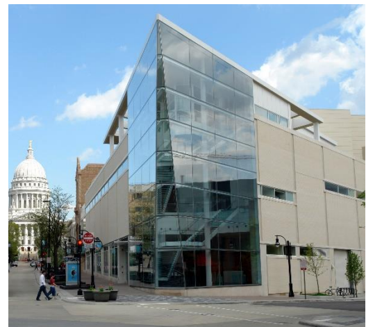
The corner of MMoCA as viewed from State Street (facing east across Johnson Street), which intersects with North Henry Street (to the right).

The bus icons above indicate where the driver may temporarily park to drop off students, coming from Johnson Street via University Ave ( red dotted line) or Henry Street via West Washington Ave ( blue dotted line).